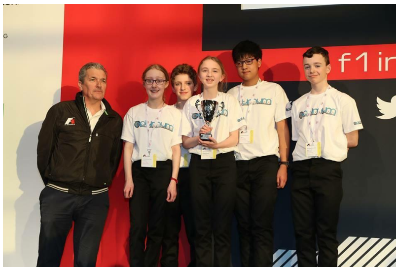
The team after coming second at the UK development class in 2018!